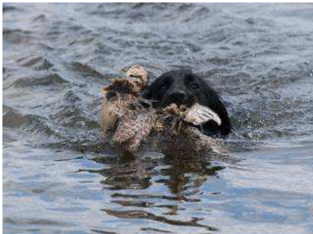
Photos from the 2009 Spring and Fall hunt tests--Senior hunt dead land work and both Senior and Master water retrieve work.